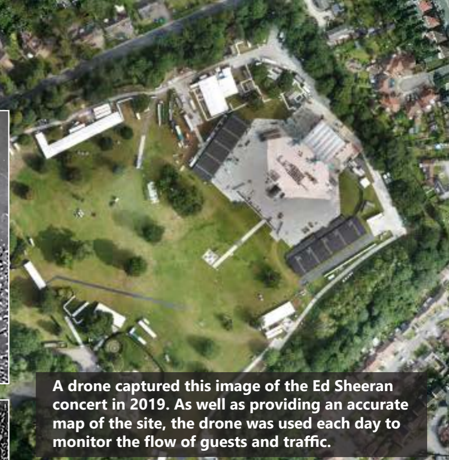
A drone captured this image of the Ed Sheeran concert in 2019. As well as providing an accurate map of the site, the drone was used each day to monitor the flow of guests and traffic.

Whenever we are out working we always get asked the same questions, in fact you can even get a t-shirt with the answers on, they are that common!