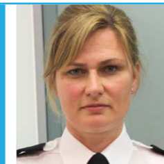
Superintendent Kerry Cutler

You can report a number of non-urgent crimes online via our website - suffolk.police.uk/contact-us