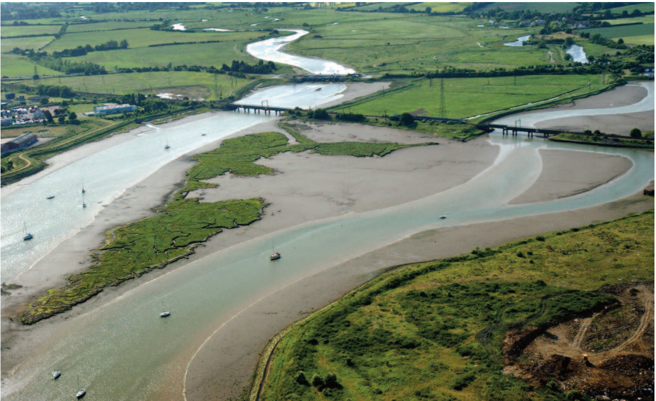
The River Stour at Cattawade: Part of the Dedham Vale AONB

If you need help to understand this information in another language please call 03456 066 067 .